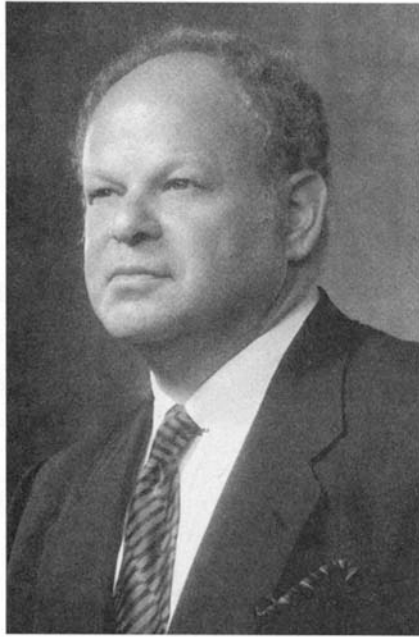
Martin E. P. Seligman